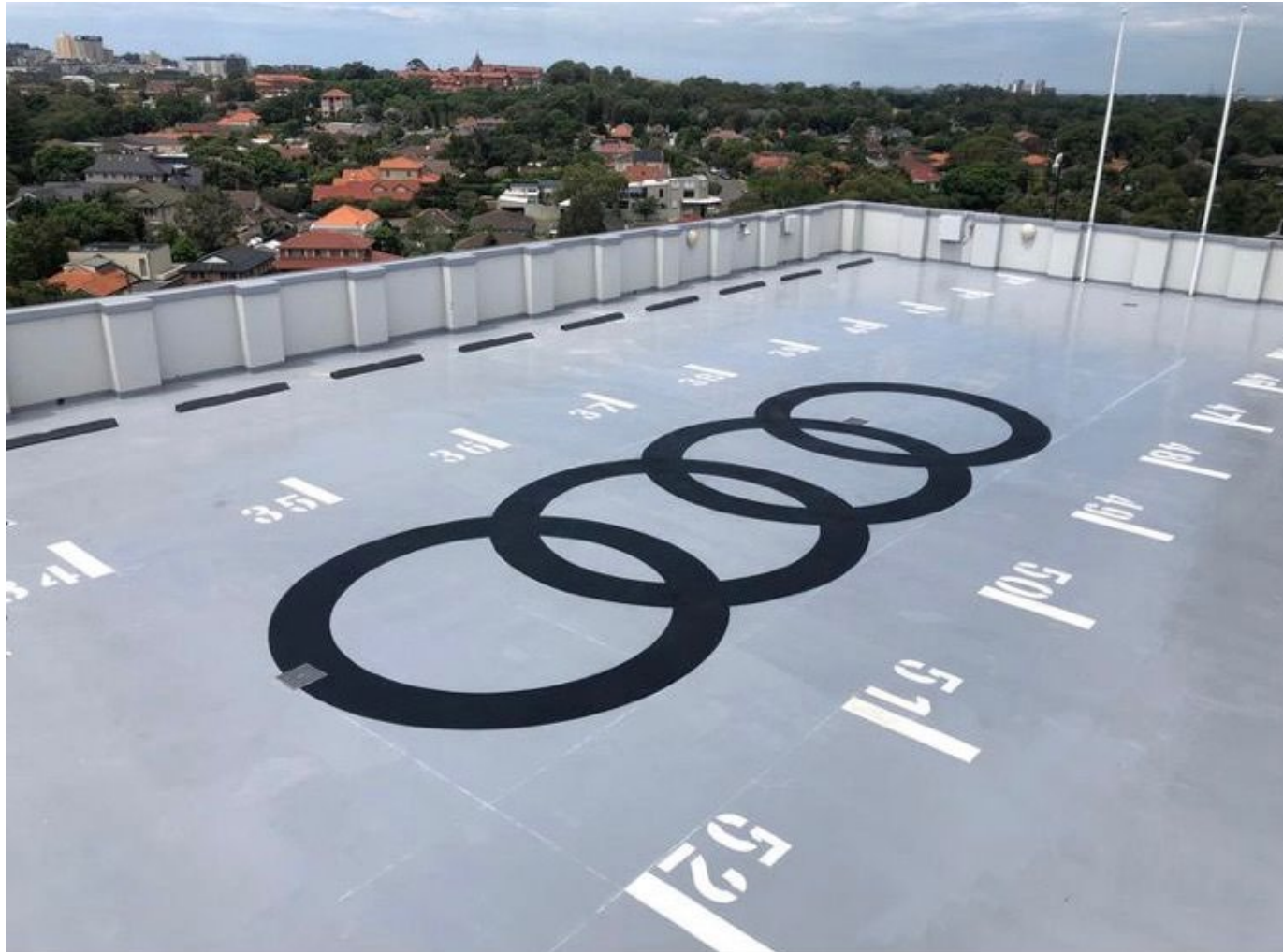
AUDI CENTRE SYDNEY, NSW (2019) 2,320 m 2