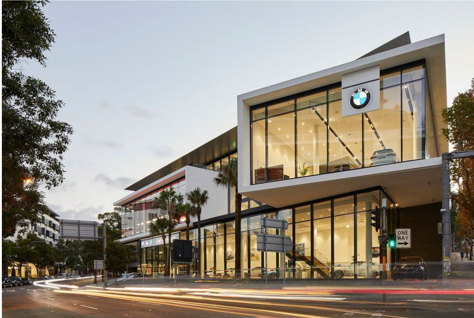
BMW AND MINI CENTRE RUSHCUTTER'S BAY, NSW (2019) 5,152 m 2